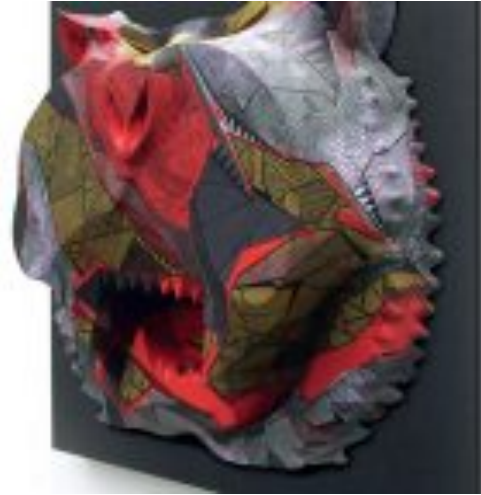
Tora (Tiger), I Yasumichi Nakagawa – Japan Textile art installation, mixed media 120 x 120 x 28 cm. 2015

In the ‘G7 of Art’ he is showcasing two giant tiger masks made of dyed textiles, paint, and wire on wood panels. The tiger is not autochthonous of the ‘land of the rising sun’, where the species and its myth was ‘imported’ from China, possibly in the VIII th century. Dating to that period is the Manyoshu , the earliest Japanese poem in which mention is made of the tiger – still a symbol of dignity and courage. Tiger-shaped papier maché masks are donated as wishing well gifts during the Shinno Festival in Osaka since, according to legend, a tiger lived in the castle of that town.