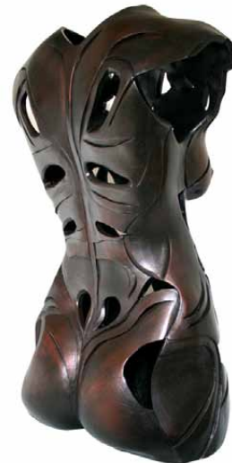
Perfect Fit Louise Giblin – United Kingdom Bronze sculpture 66 x 40 x 26 cm. Edition no. 10/12. 2010