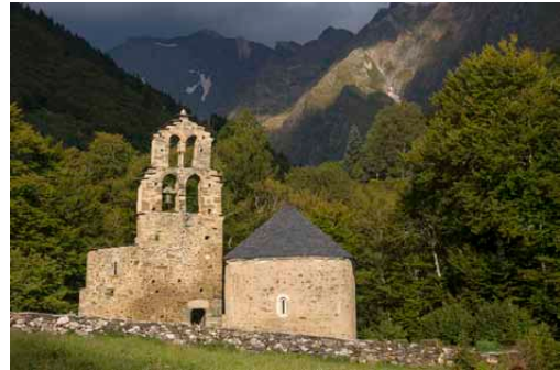
Templar Chapel of Notre-Dame de l'Assomption (XII th c.) in Aragnouet, France Jean-Pierre Rousset – France Photograph, 70 x 100 cm. Taken with Nikon D800E on 14 September 2014